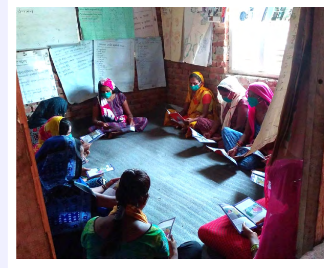
Start and Improve Your Business (SIYB) training, at women-led Community Discussion Centres in Nepal.

Aside from the positive economic outcomes for SIYB participants, women reported increased confidence and enhanced leadership skills that they utilize in every facet of their lives. They felt empowered to negotiate more equitable household decision-making and credited the initiative with contributing to lowered incidences of VAWG, including CEFM, within their communities.