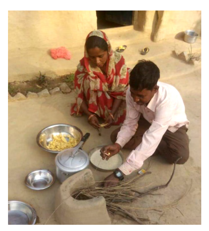
Husband and wife working together in their kitchen after counselling on VAWG.

Informal skill sharing amongst women within the CS and AC projects also provided opportunities for women to build skills and confidence to pursue income-generating activities. This was especially valuable when formal mentorship programs were unavailable. When women saw their peers successfully engaged in income-generating activities, they were inspired to follow in their footsteps. For example, in BANGLADESH and NEPAL , women who had left abusive partners, graduated from CS-offered livelihoods trainings, established their own enterprises, and subsequently began to mentor other women in similar situations to follow in their footsteps and build their financial independence.