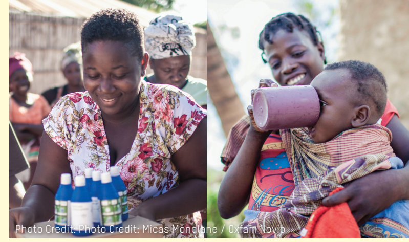
Your gifts save lives.