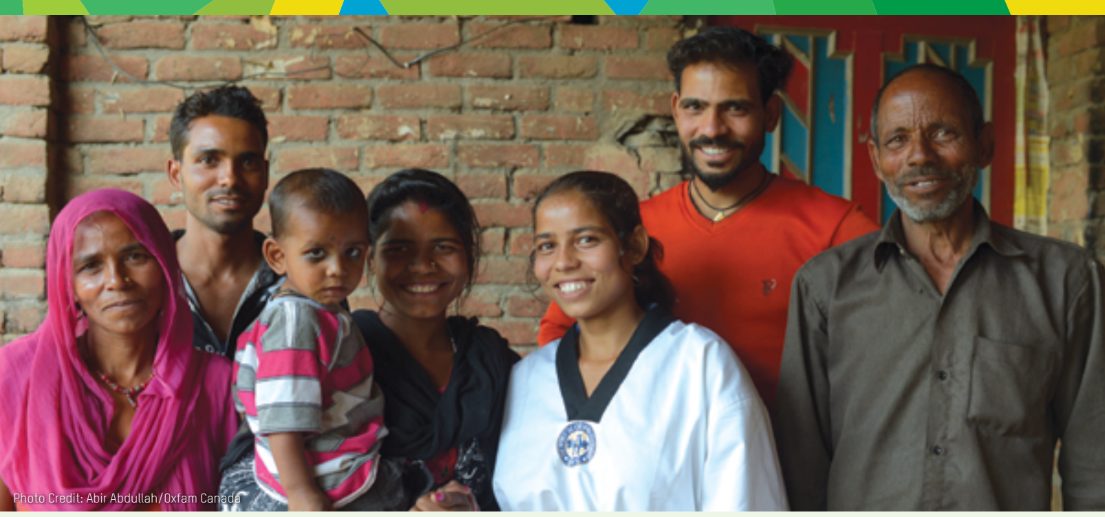
Dolly with her proud family.

path for other girls in the village who want to study and join sports. Other parents will support their daughters."