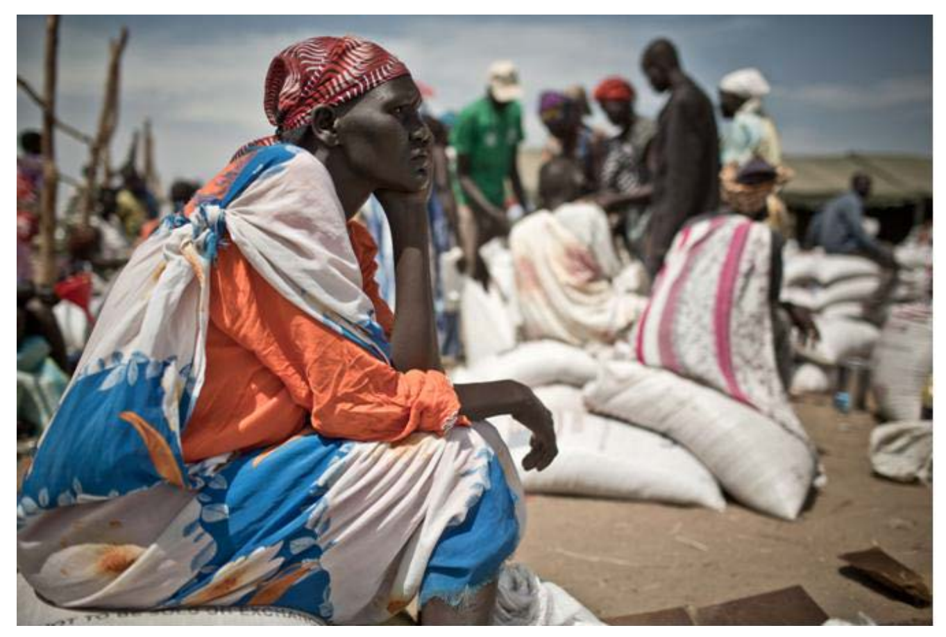
A woman waits for food in Mingkaman, Lakes state, April 2014.