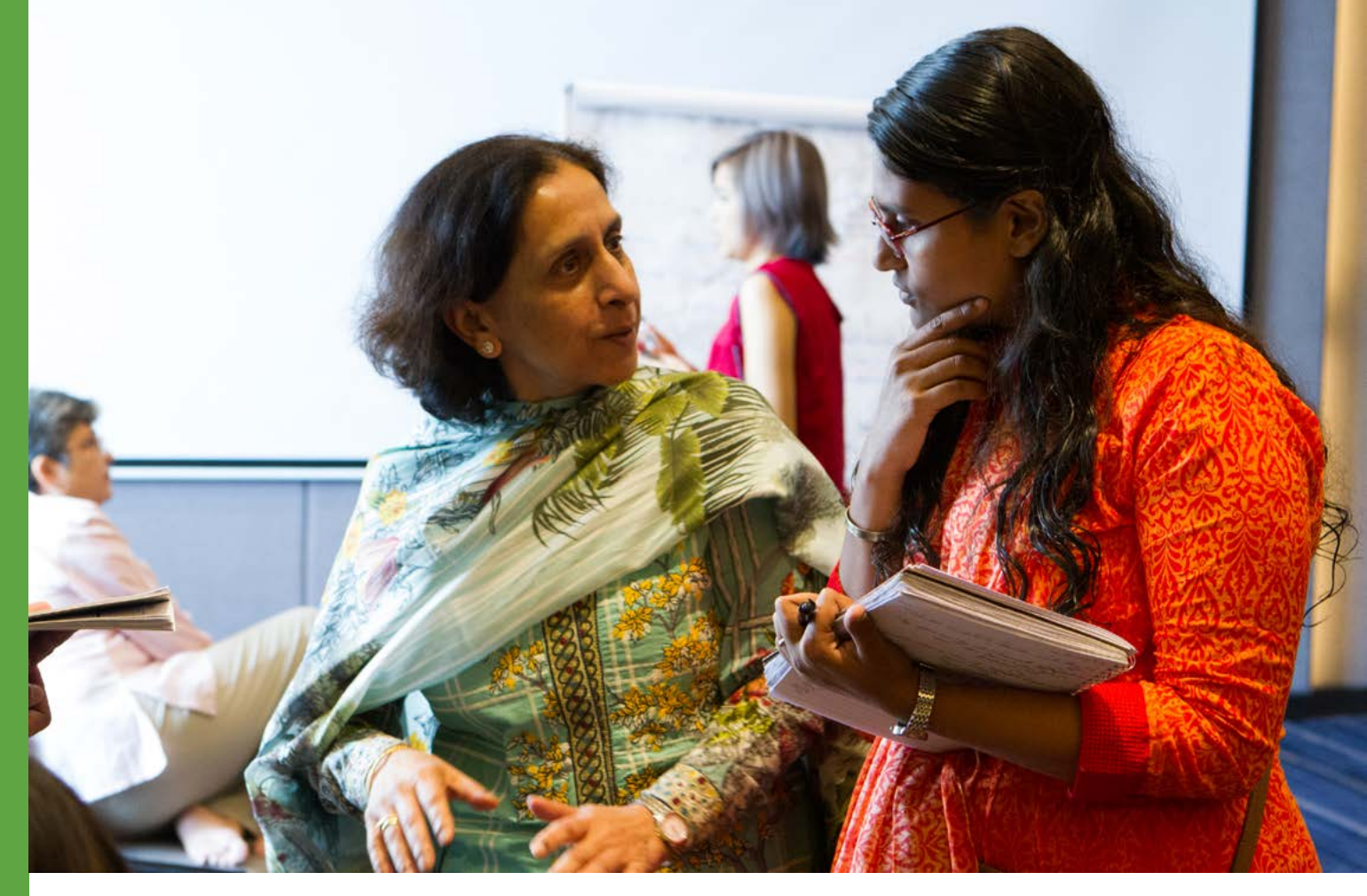
Participants at a workshop discuss the role of women's rights actors in humanitarian action