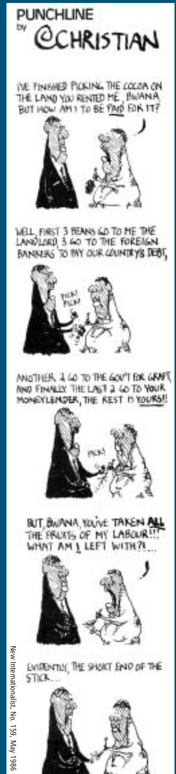
New Internationalist, No. 159, May 1986